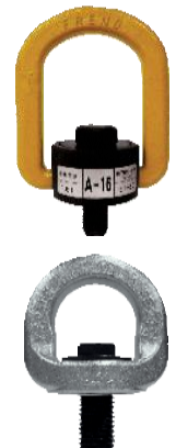
Rotating eye bolt